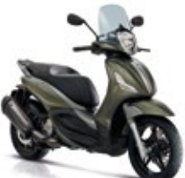
VERDE OPACO with black saddle

COMPANY WITH QUALITY SYSTEM CERTIFIED BY DNV = ISO 9001 =