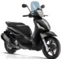
NERO OPACO CARBONIO with black saddle