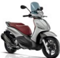
ARGENTO OPACO COMETA with red saddle