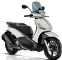
BIANCO STELLA with black saddle