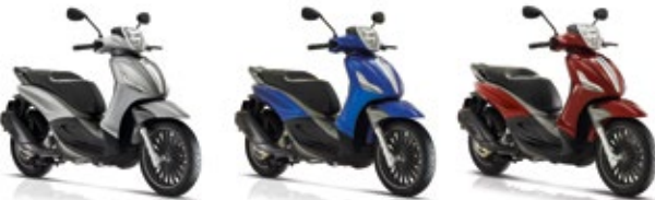
ARGENTO OPACO COMETA